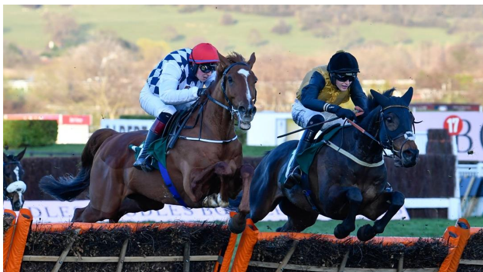
Banbridge (red cap) on his way to victory in the 2022 Martin Pipe