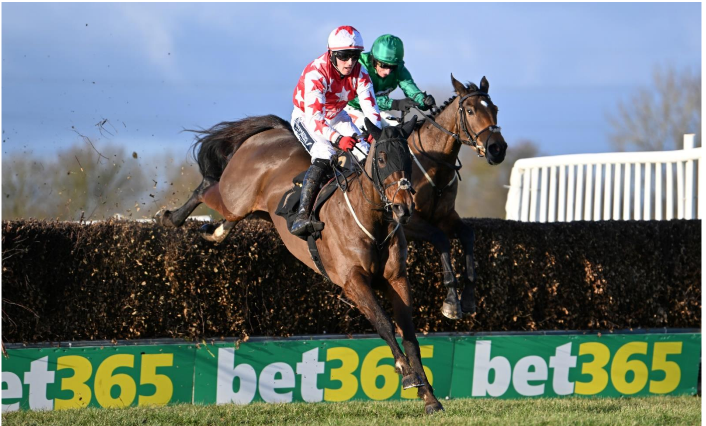
Jeremys Flame defeating Zambella at Huntingdon

SLH: Irish trained Jeremys Flame won at Huntingdon on her latest start, easily beating a few of our top mares. There are a couple of other Irish mares that are at least as good as her, so unless the weather takes a turn for the worse it looks an Irish dominated race again.