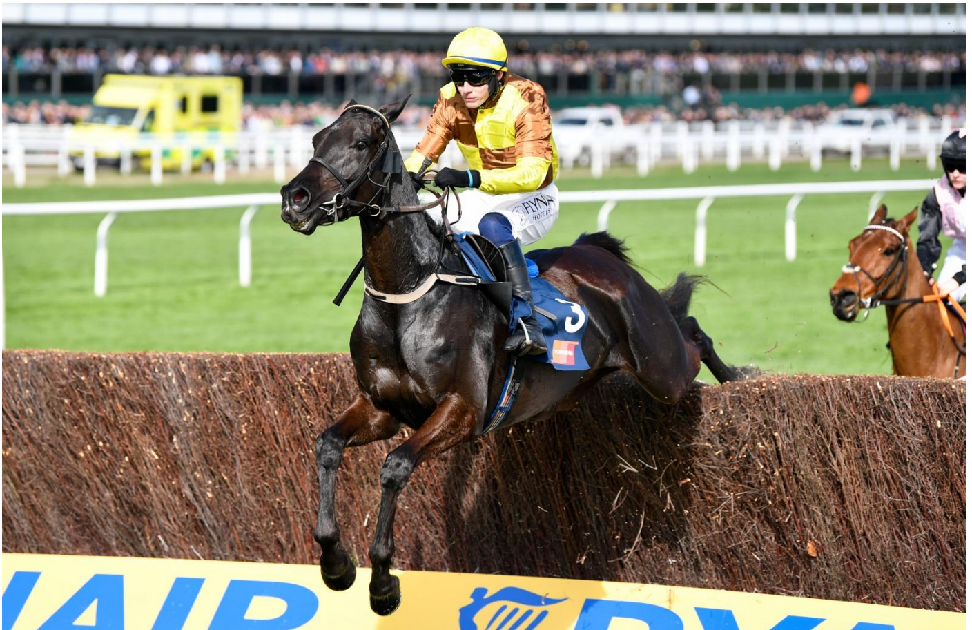
Galopin Des Champs at last year's festival