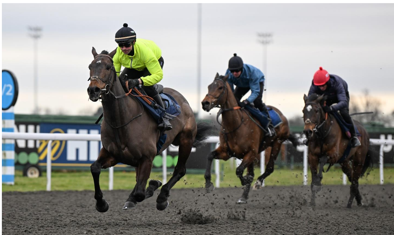
Constitution Hill leading the way in preparatory work at Kempton