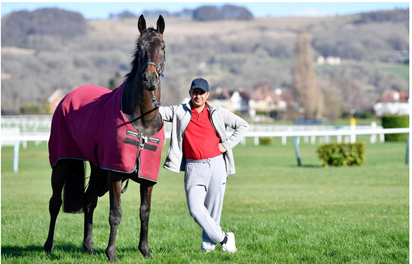
Energumene – ‘a real poser to go with his talent on the track’

I'm not one for betting so I'm never going to be caught giving tips, I just like to see the best horses shine on the biggest stage. Whatever happens at this year's Festival, the most important thing is that all horses and jockeys come home safe and sound. Hopefully I'll be sharing some spectacular photos when the week is over!