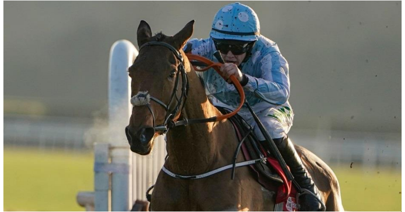
Honeysuckle & Rachael Blackmore. Unbeaten under rules.

time in winning her latest Irish Champion Hurdle by 10 lengths. We are still not sure where the ceiling of her ability lies, and she has the ideal partner in Rachael Blackmore. Epatante is top class, the reigning champion. They are two outstanding mares, and it is correct that they dominate the market.