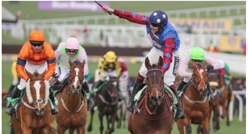
Paisley Park winning the 2019 Stayers Hurdle.

Paisley Park's running style is very well suited to Cheltenham and he may well return to his very best, in which case he will take plenty of beating.