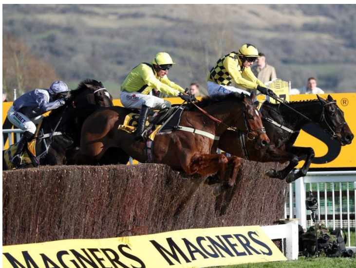
Al Boum Photo (inner) clears the final fence on his way to another Gold Cup victory.

He would need to improve further, but has had only five chase starts to date and the improvement required could be forthcoming.